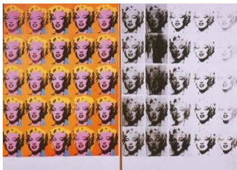
Fig. 1. Warhol, Andy. Marilyn Diptych . 1962. Tate Galleries , www.tate.org.uk/art/artworks/warhol-marilyn-diptych-t03093 . Accessed 23 Aug. 2017.