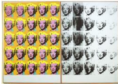
Figure 1. Andy Warhol, Marilyn Diptych , 1962, acrylic paint on canvas, 2054 x 1448 x 20 mm, Tate Modern, London, http://www.tate.org.uk/art/artworks/warholmarilyn-diptych-t03093 .

Note: Do not include a Bibliography if a credit line is given in the body of the text; See note above.