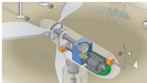
Figure 3. Illustration of a Wind Turbine, "How do Wind Turbines Work?," Office of Energy Efficiency & Renewable Energy, accessed June 27, 2018, https://www.energy.gov/eere/wind/how-do-wind-turbines-work .

Note: Provide a title that describes the image.